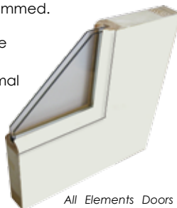
All Elements Doors are double glazed

M&B Elements fibreglass doors are double glazed (insulated glass). Offering up to 30% greater thermal and acoustic values than that of single glazing alone.