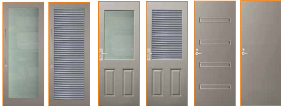
Caspian Double Glazed Caspian Mini Blind Double Glazed Panama Double Glazed Panama Mini Blind Double Glazed Pacific *Fibreglass Weathercote

Options and designs have increased over the years with regards to entrance doors. M&B have recognised the need for builders & renovators wanting a 'hassle free solution' by developing and introducing an energy efficient external door option.